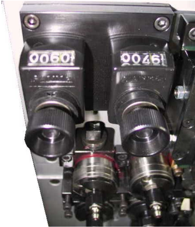
EASY ROLLER PRESSURE ADJUSTMENT BY SCALE METER