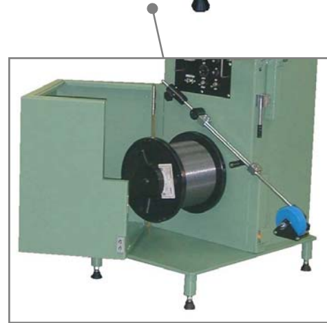
OPENABLE SAFETY COVER WITH SHUT DOWN SWITCH