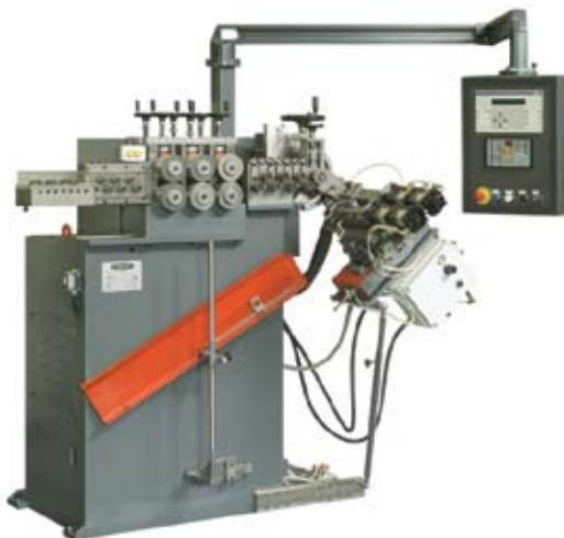
FSAB2 Ring Coil-Weld.

OMAS FSA production ring machines are recognized for their speed and quality of the products produced. These machines can produce rings within a wire range of 1 to 12 mm (0.04" to 0.47") depending on model selection. Automated welding systems are offered for butt welds, TIG welds and introduction of Argon gas if flash is a concern. Overall ring diameters range from 15 to 2200 mm (0.590" to 86"). Specialized positioning