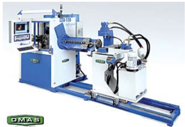
CEB 110 w/ Press Operation.

OMAS CEB machines use a compact head design, ideal for close bends and high-speed production. A unique anti-torque feature eliminates dimensional distortion typically created within parts with long wire development and many bends. The anti-torque feature is standard on all OMAS CEB machines. The ability to