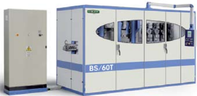
BS/60T High Speed Multi-Slide.

OMAS high-speed multi-slide forming machines provide an additional option for high volume components which call for manufacturers to find increased productivity through product automation. High-speed mechanical machines are available for products from 0.5 to 10 mm (0.020" to 0.394") wire diameters.